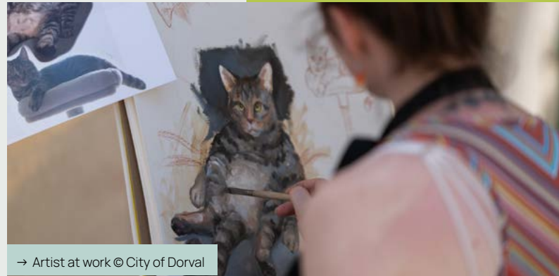
→ Artist at work

A strong cultural environment relies on solid relationships, structured support, and clear recognition of those who bring it to life. Dorval seeks to strengthen its cultural ecosystem by valuing artists, organizations, and cultural workers, fostering collaboration across sectors, and supporting the emergence of new practices.