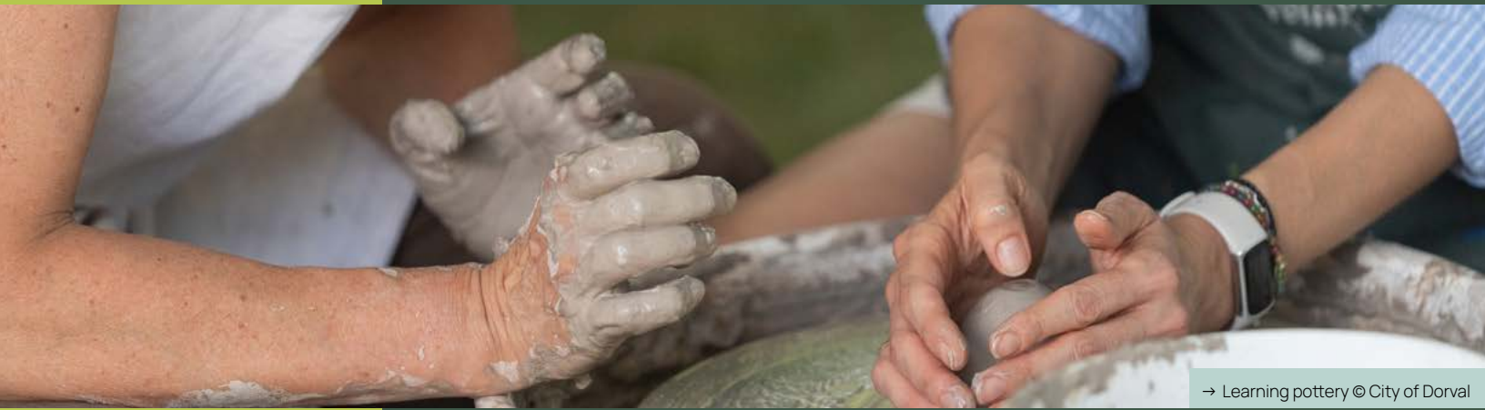
→ Learning pottery