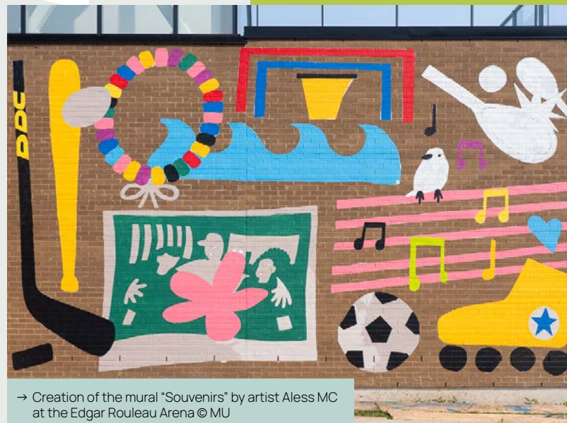
→ Creation of the mural "Souvenirs" by artist Aless MC at the Edgar Rouleau Arena

Promote access to culture and heritage in public spaces throughout the territory and fully integrate them into residents' daily lives.