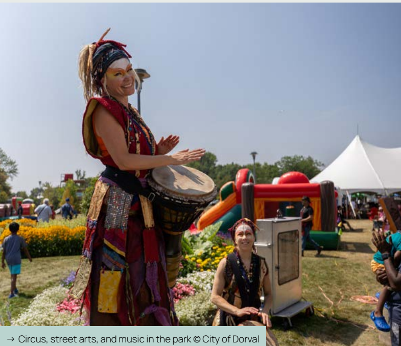
→ Circus, street arts, and music in the park

Create opportunities to promote the participation of local artists in the cultural offering.