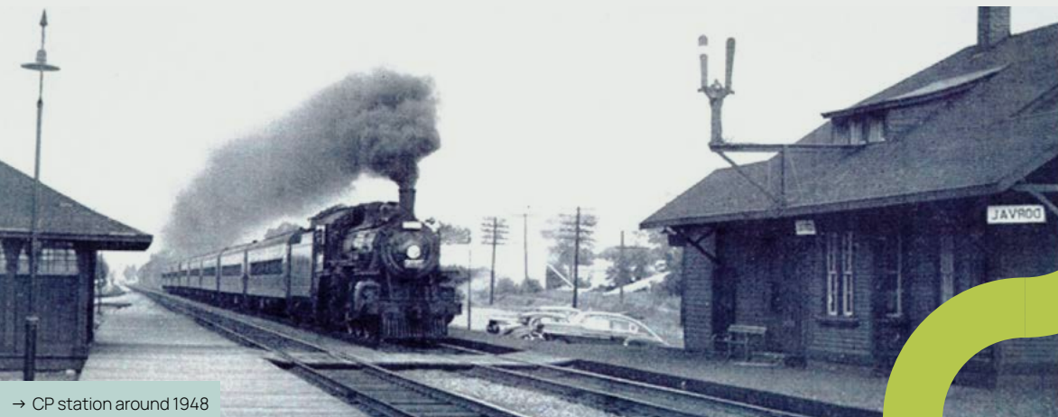
→ CP station around 1948

Over the centuries, Dorval evolved slowly, maintaining a rural character until the early 20th century. Its land, well-suited for agriculture and located along the expanding railway network, attracted Montrealers seeking a summer retreat. The arrival of the railway in the second half of the 19th century encouraged the construction of secondary residences and stimulated residential development.