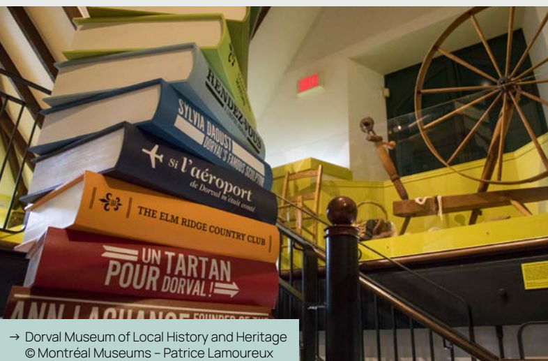
→ Dorval Museum of Local History and Heritage

Reinforce the role of the City of Dorval as a driver of cultural development by catalyzing collaboration among partners and fostering citizen participation and ownership.