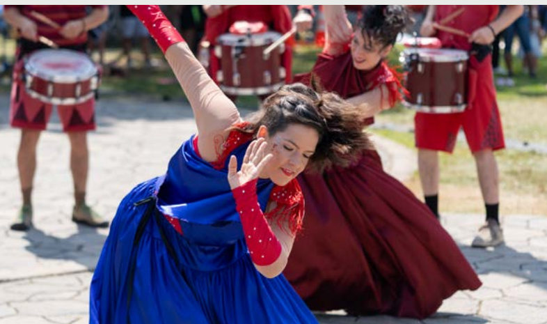
→ Rhythms of the World at Dorval Celebrates

Increase the visibility and accessibility of cultural venues, offerings, and activities, and energize programming by multiplying hybrid events to enrich the public experience.