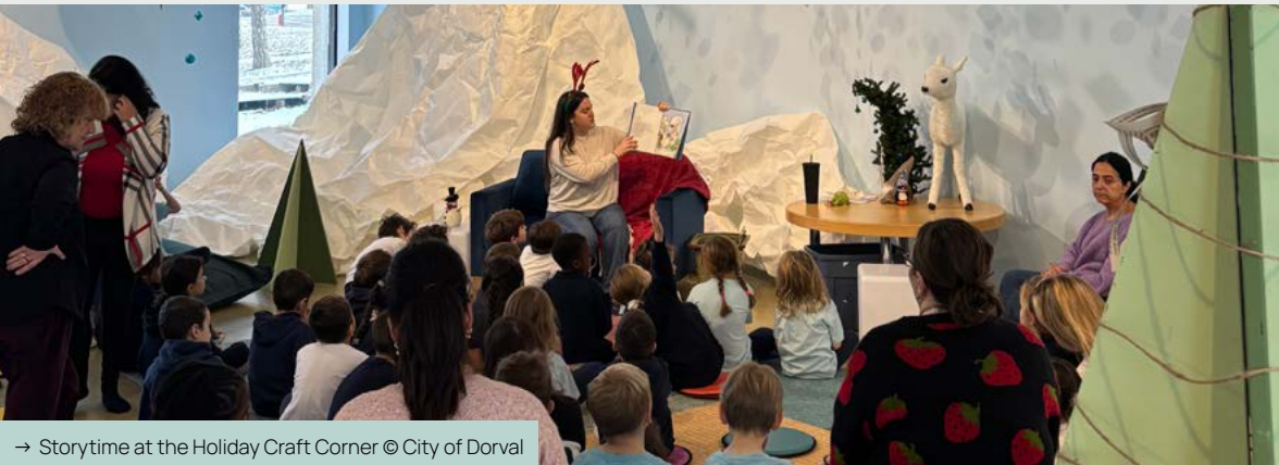
→ Storytime at the Holiday Craft Corner

The City of Dorval sincerely thanks all those who contributed to the development of this first Cultural Policy. Your generous participation, ideas, expertise, and commitment enriched every step of the process.