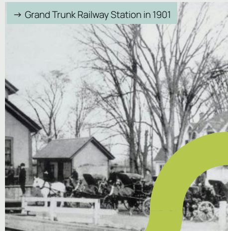
→ Grand Trunk Railway Station in 1901

Located on the shores of Lake Saint-Louis, the territory of Dorval was long a place of passage and exchange for Indigenous peoples. In the 17th century, the Sulpicians established a missionary post on this land, marking the beginning of structured colonial development. The mission of La Présentation-de-la-Sainte-Vierge, founded in 1667, was part of a dynamic of settlement and landscape transformation. From its earliest days, this meeting point played a strategic role in the region's development.