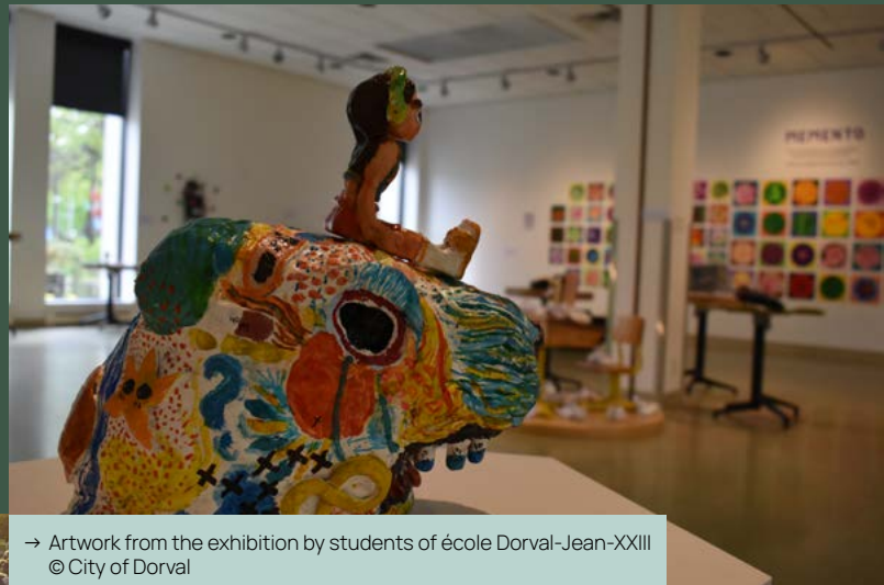
→ Artwork from the exhibition by students of école Dorval-Jean-XXIII

This Cultural Policy also aligns with and complements Dorval's Strategic Planning – 2033 Vision, adopted in June 2024. It is further connected to the Parks and Recreational Buildings Master Plan, as well as the City of Dorval's Action Plan for Universal Inclusion.