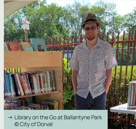
→ Library on the Go at Ballantyne Park