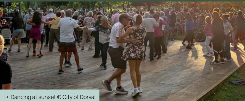
→ Dancing at sunset